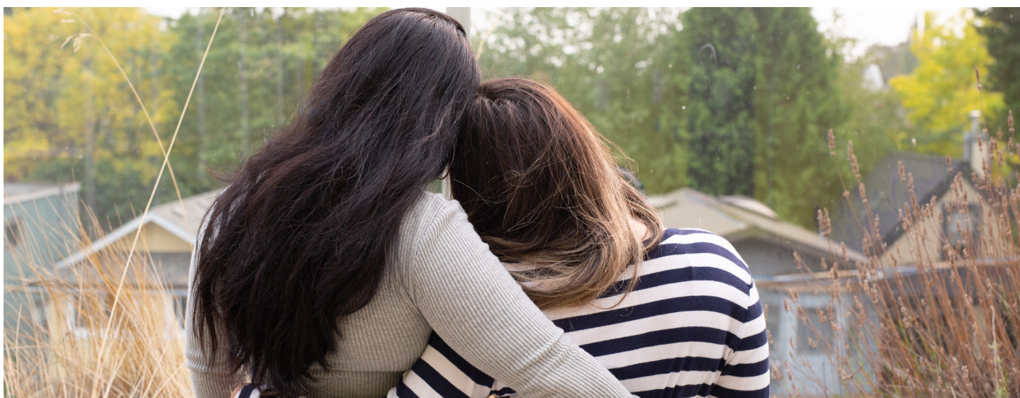
Mother and daughter at YWCA Housing community.