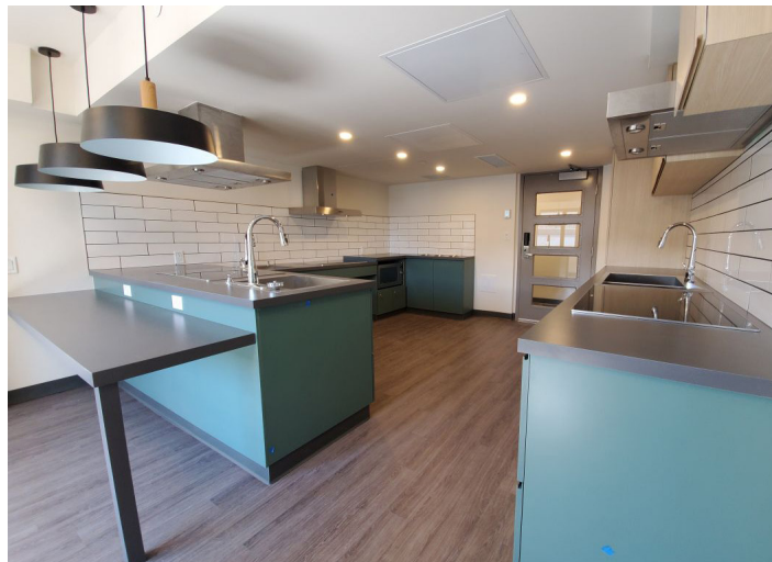
Hotel guest kitchen in the new tower.

Now the team is focused on innovating and adapting services and strategies. When BC moved to Phase 3 and allowed for non-essential travel within the province, we began a series of promotions to attract potential guests and serve new community needs. In addition to offering daily, weekly and monthly stays, we also started offering self-quarantine options.