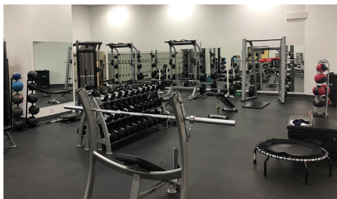
YWCA Fitness & Racquet Club.

With the recent opening of the new YWCA Fitness + Racquet Club in Bentall 4, we are excited to offer expanded amenities, adding squash/racquetball courts and even more workout space. Just a five-minute walk apart, members have access to both locations. The new centre has 18,000 square feet