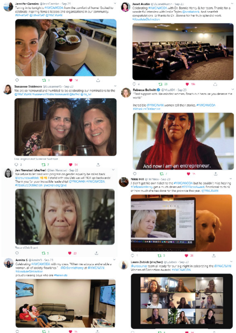
Attendees connecting on social media; our hashtag #YWCAWODA was on the top ten trends in Canada.