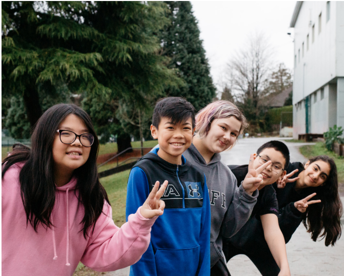
YWCA Youth Education program participants.

For many students, the transition from elementary school to high school can be challenging and complicated. Concerns about changes in workload and school environment, different friends, new social pressures and increased responsibilities can feel overwhelming.