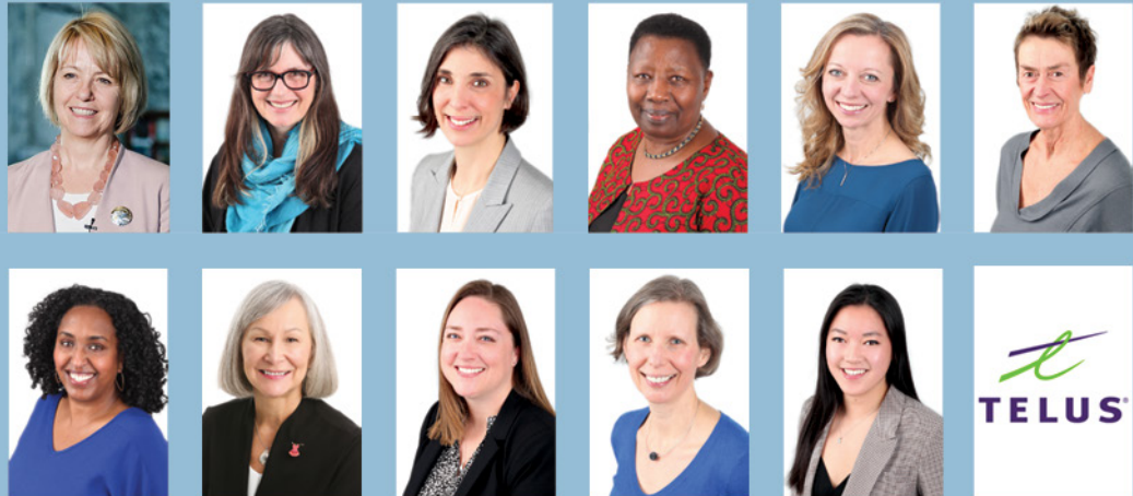
The 2020 YWCA Women of Distinction Awards recipients.

We are grateful that Scotiabank returned for their milestone 10th year as presenting sponsor. Fourteen recipients were announced, including two in the inaugural Reconciliation in Action award, which recognizes two unique women, an Indigenous leader and an ally, working independently and committed to finding a new way forward. A full list of this year's award recipients can be found here.