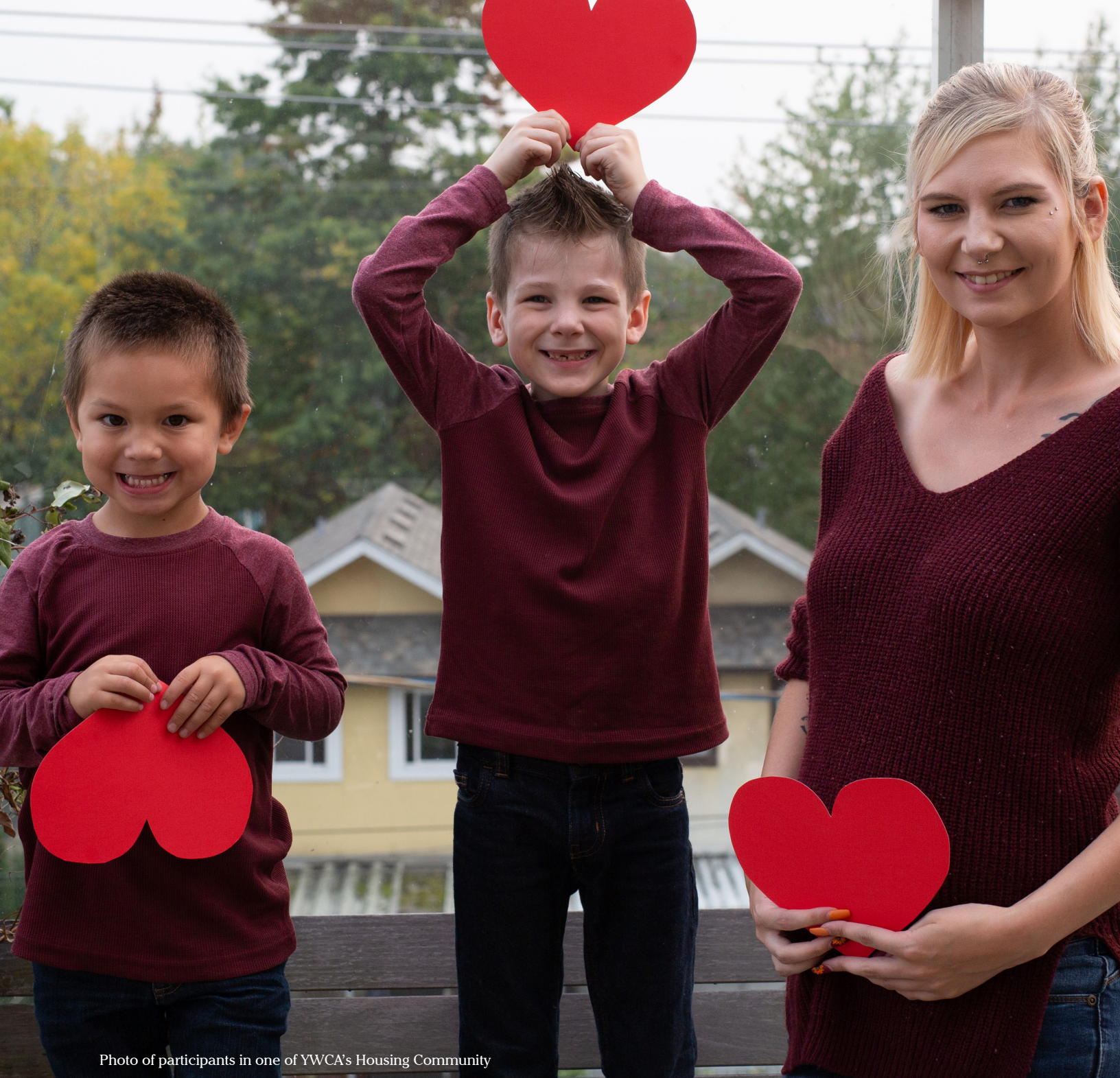
Photo of participants in one of YWCA's Housing Community

Heartfelt gratitude for your passion and generosity.