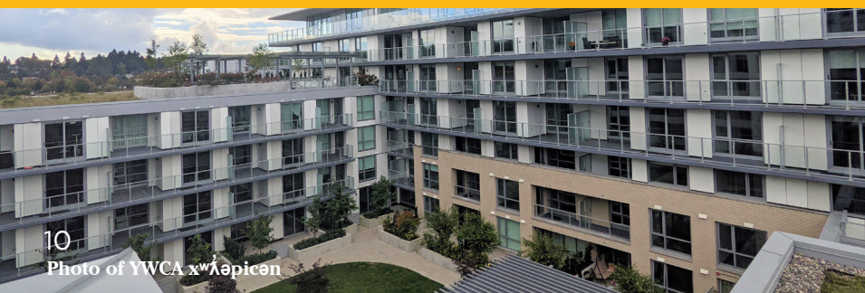
10 Photo of YWCA x'Λepicōn

Single moms and children made their home in one of 14 YWCA housing communities in 2021.