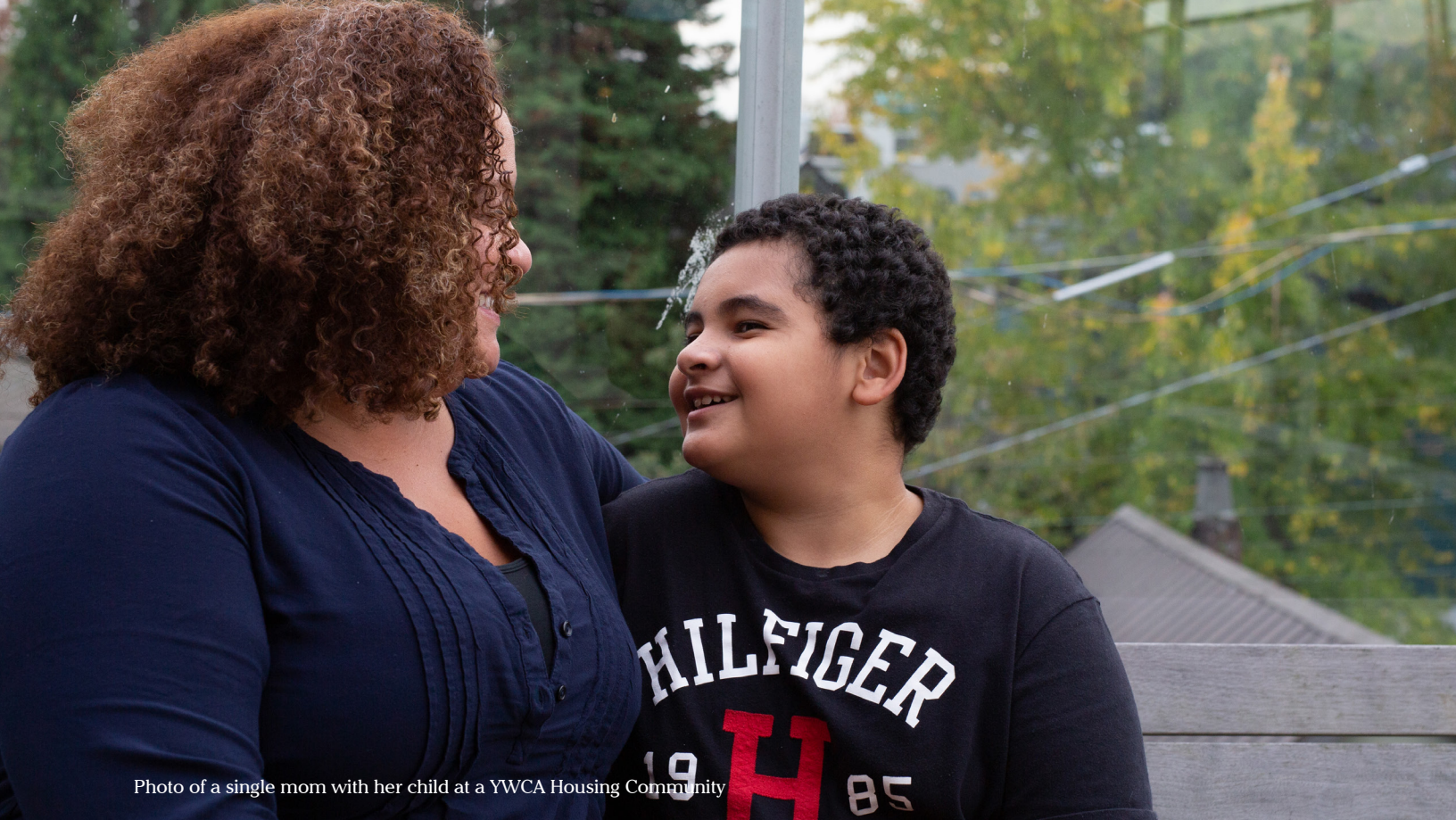
Photo of a single mom with her child at a YWCA Housing Community