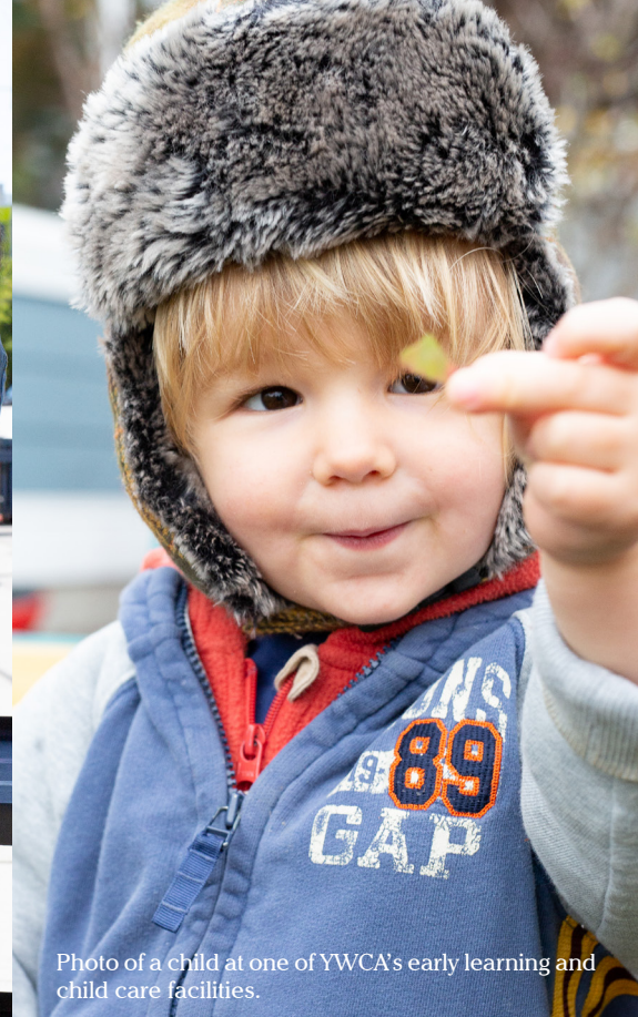
Photo of a child at one of YWCA's early learning and child care facilities.