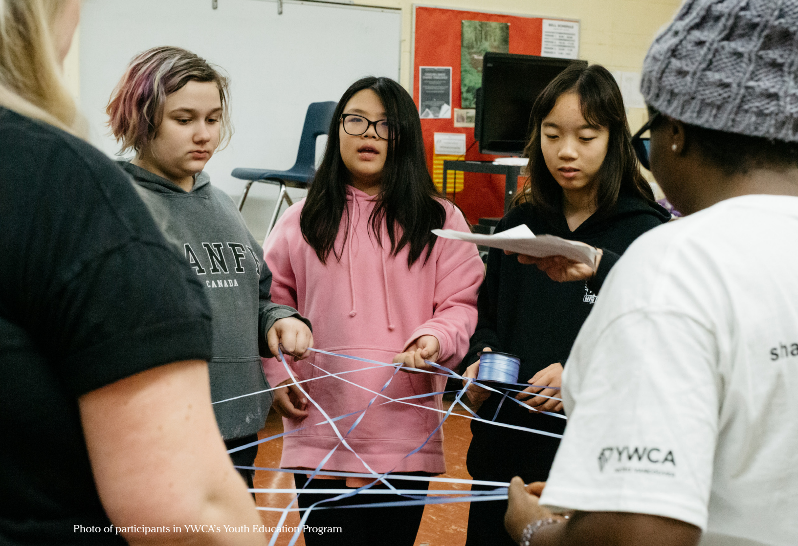
Photo of participants in YWCA's Youth Education Program