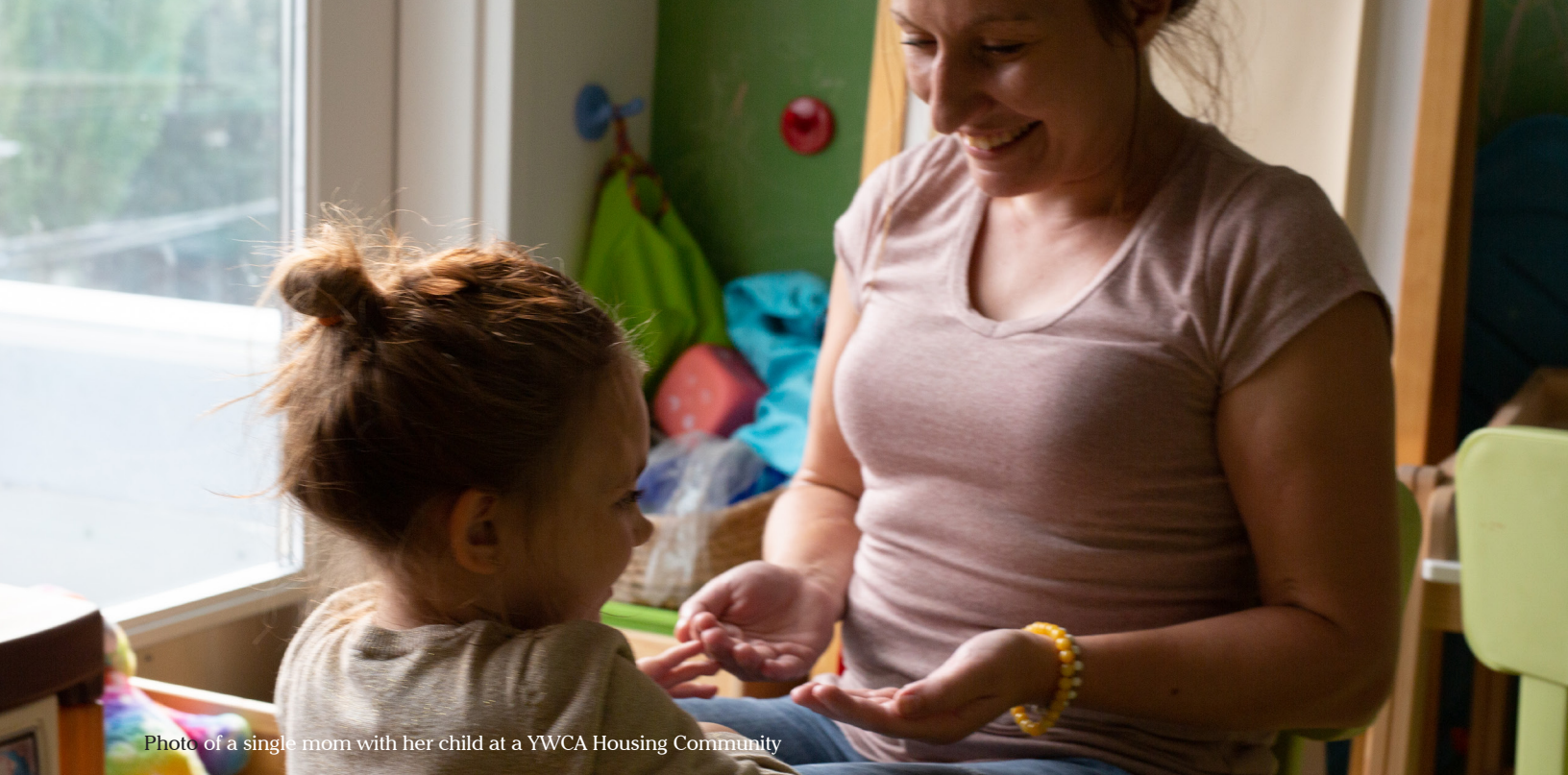
Photo of a single mom with her child at a YWCA Housing Community