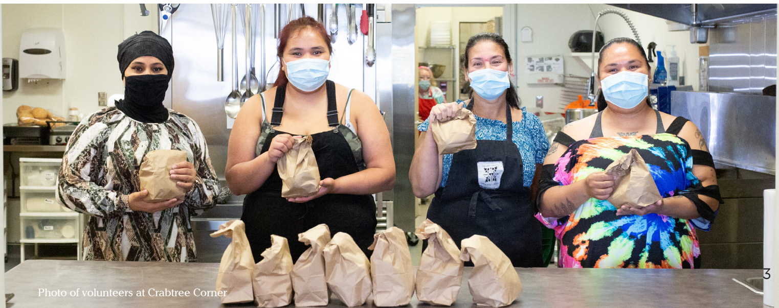
Photo of volunteers at Crabtree Corner

We are so grateful for what this collective of supporters has accomplished.