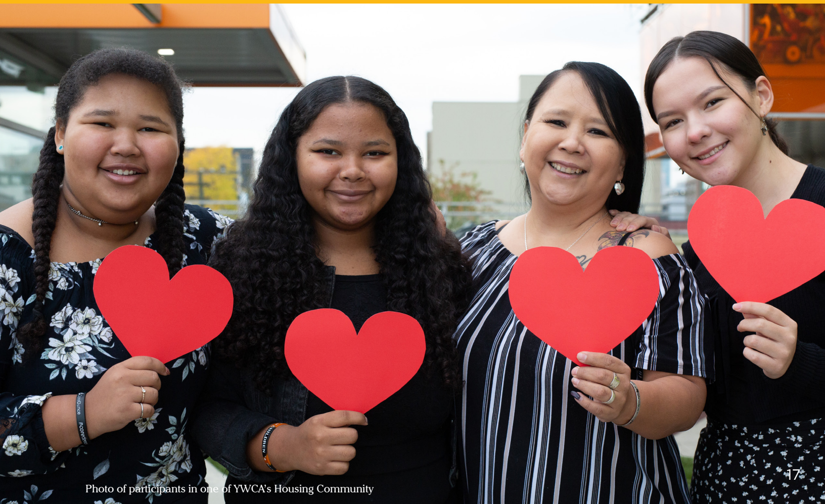
Photo of participants in one of YWCA's Housing Community

We have achieved much during this campaign – we have built homes, created programs and supported people. We mark this year with gratitude and confidence, knowing that we have a strong foundation of support and expertise from you, our committed donor community.